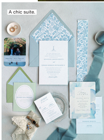
A chic suite.