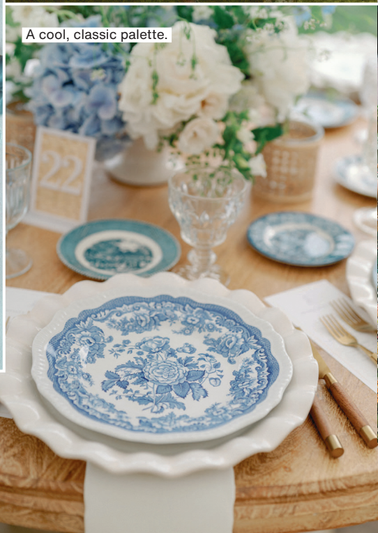
A cool, classic palette.