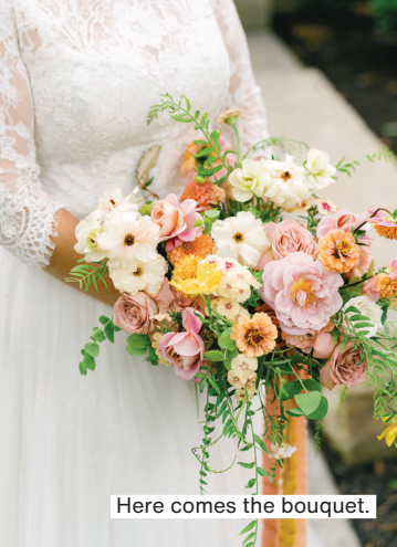
Here comes the bouquet.