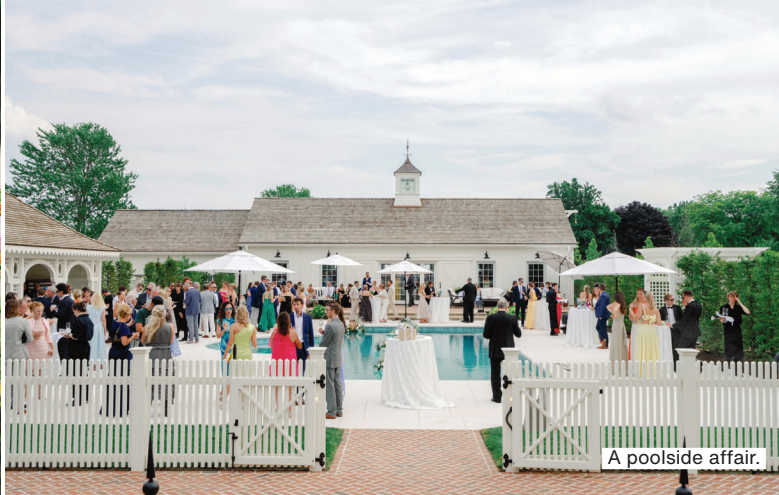
A poolside affair.