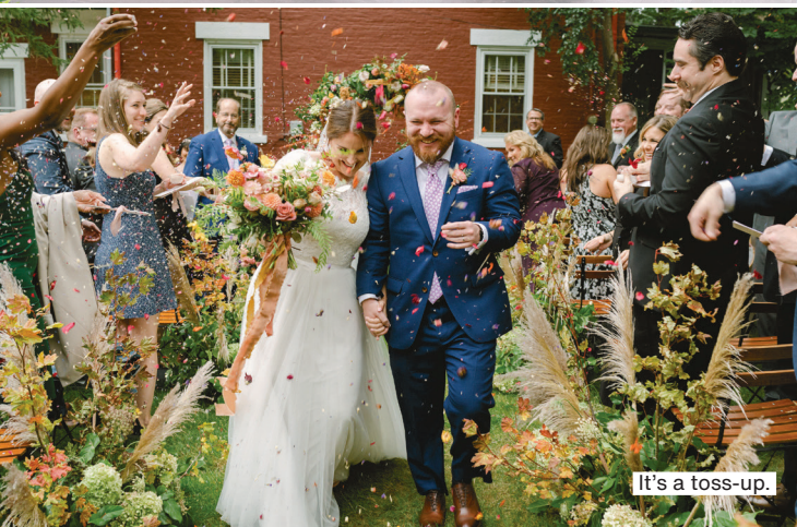
It's a toss-up.