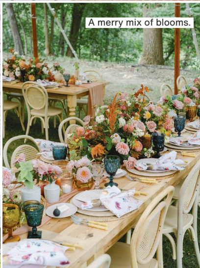
A merry mix of blooms.